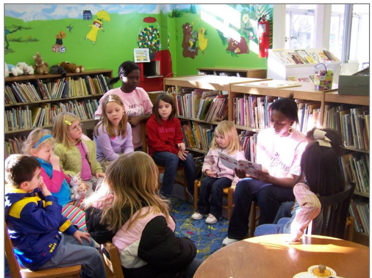
HIPPY Group Meeting